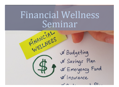
MARCH 25-27, 2024

With that in mind, we are offering FREE events to the community to help educate and guide, with the goal of enhancing financial wellness. Now is the time to start planning for your future.